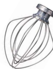
WIRE WHISK (K45WW)