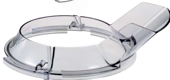
POURING SHIELD (KPS2CL)