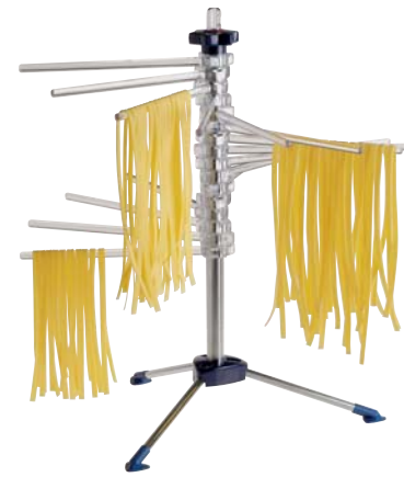
PASTA DRYING RACK (KTMP)