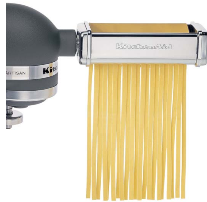
DE-LUXE PASTA ROLLER SET (KPRA)