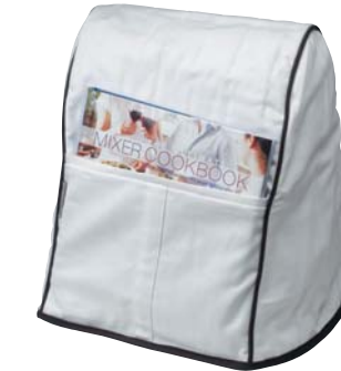
MIXER COVER (KMCC1WH)

MIXER ATTACHMENT PACK (PPPA) FGA+RVSA+FVSP