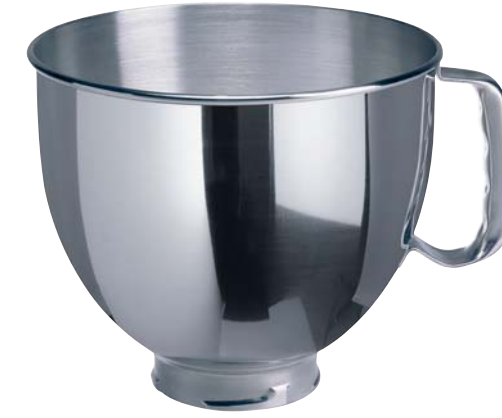
POLISHED STAINLESS STEEL BOWL (K5THSBP)