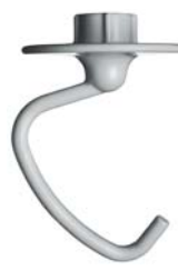
DOUGH HOOK (K45DH)

BIG CAPACITY (4.83 L) TO PREPARE SMALL TO LARGE QUANTITIES OF FOOD