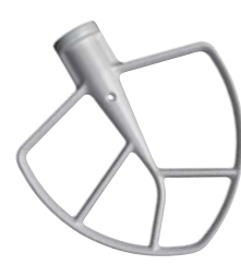
ARTISAN™ BEATER (K5THCB)