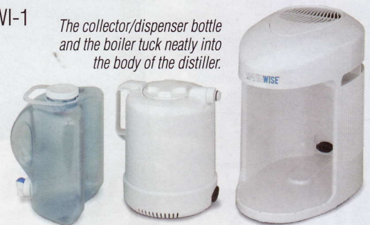
The collector/dispenser bottle and the boiler tuck neatly into the body of the distiller.

Operational maintenance and replacement requirements are essential for product to perform as advertised.