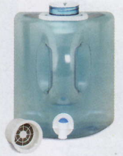
An organic carbon filter inserts into the top of the 1 gallon collector/dispenser bottle.